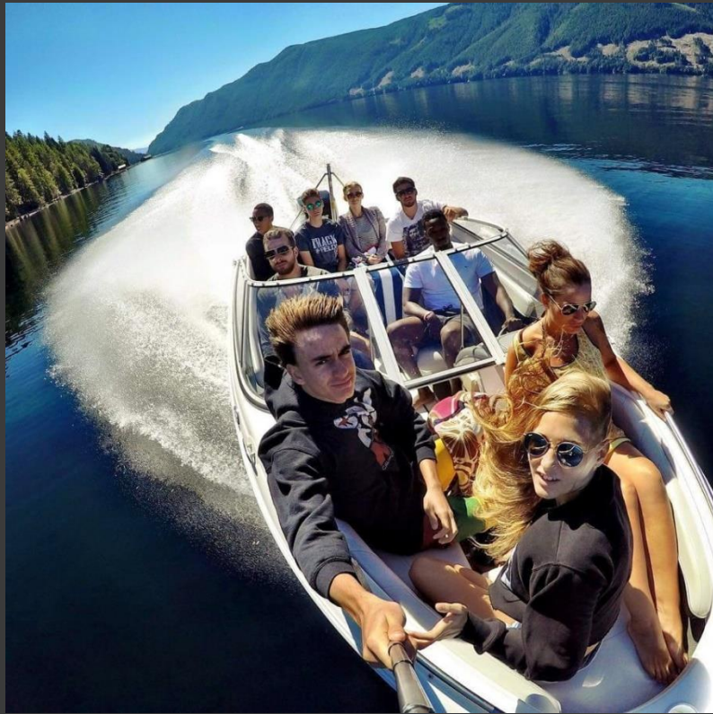
On the water