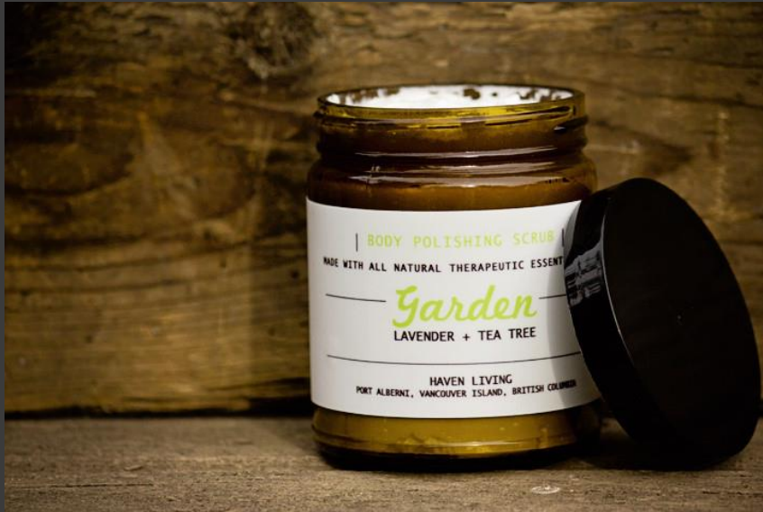
A small sample