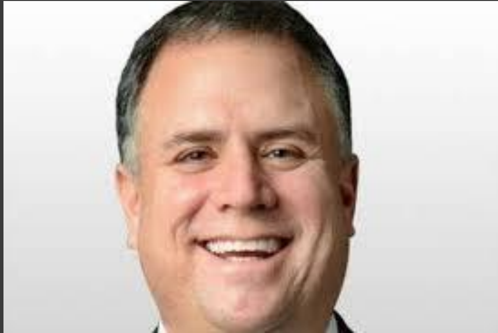
Mr. Gord Johns – Member of Parliament – Courtenay/Alberni