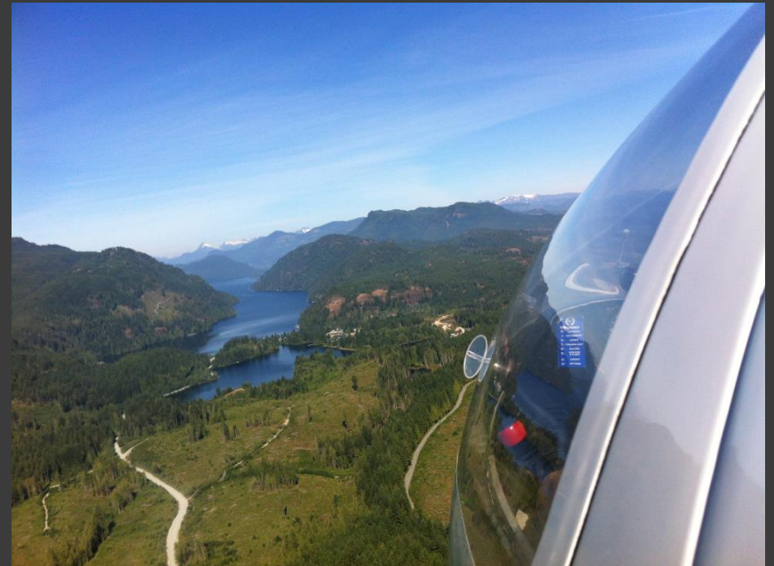
Great Central lake