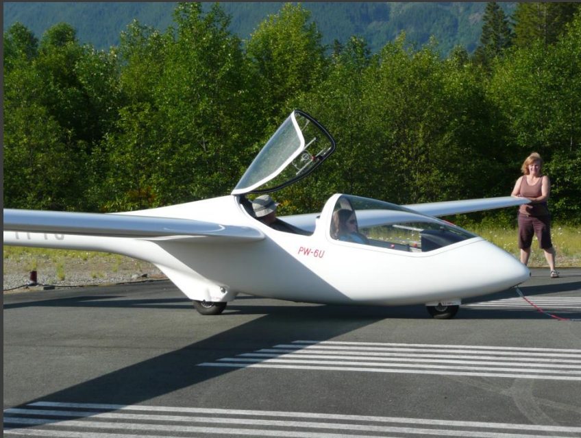
Ready for take off