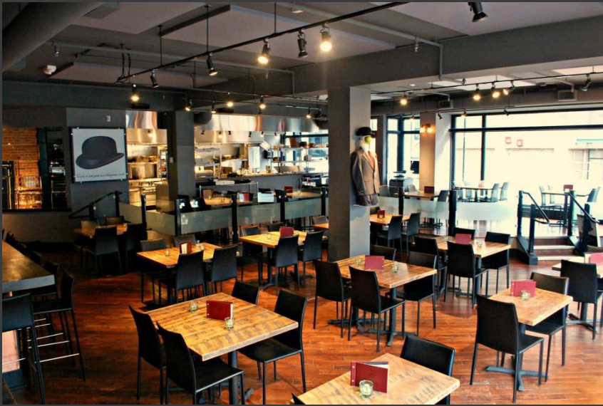
The Black Hat