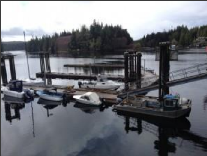
East dock - bamfield