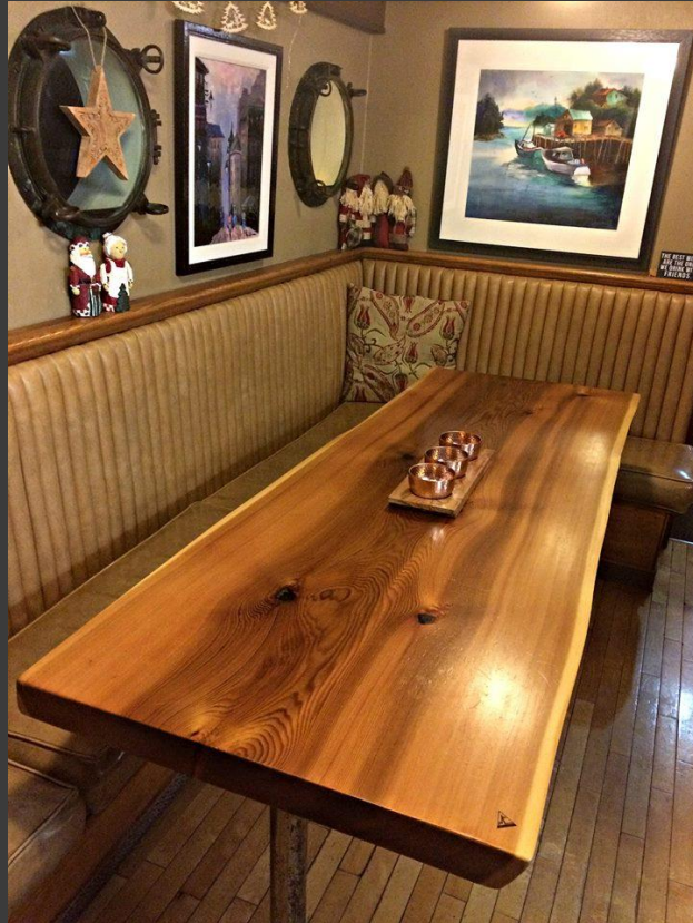
Find this at Swept Away Inn