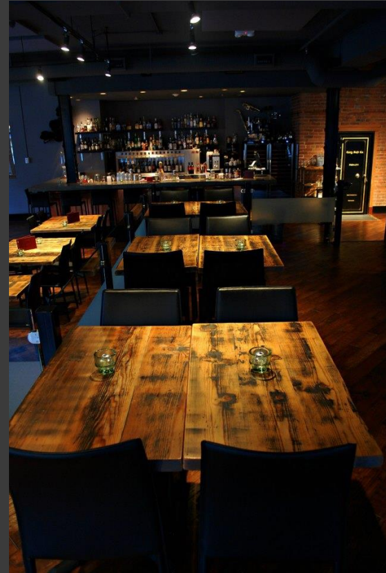
This is in Victoria