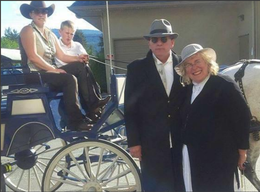
Horse drawn carriages