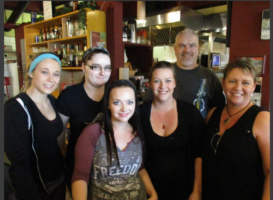
Some of the 25