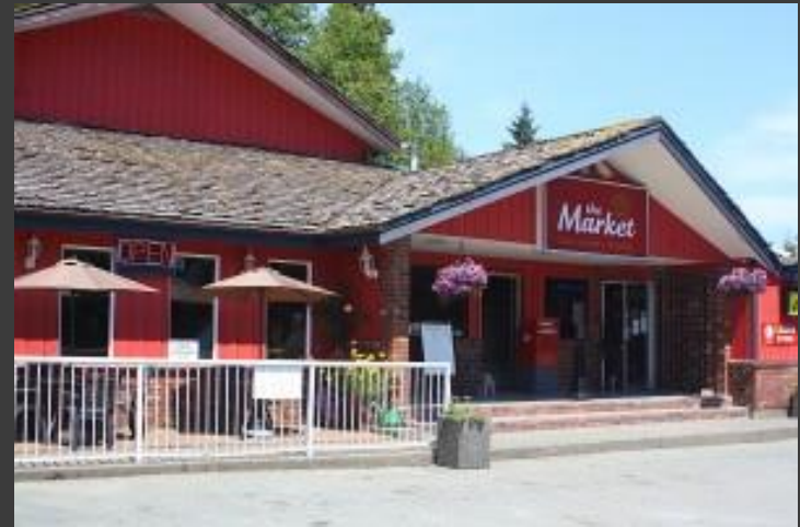
The market - bamfield