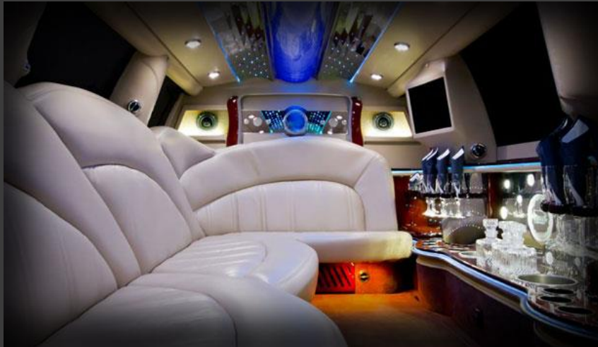
A peek inside