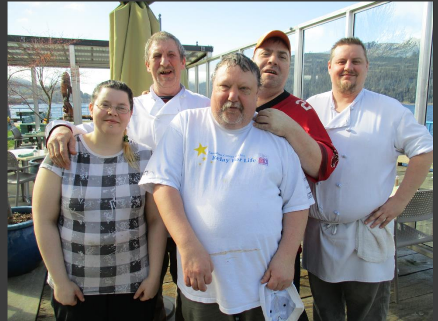
The whole crew