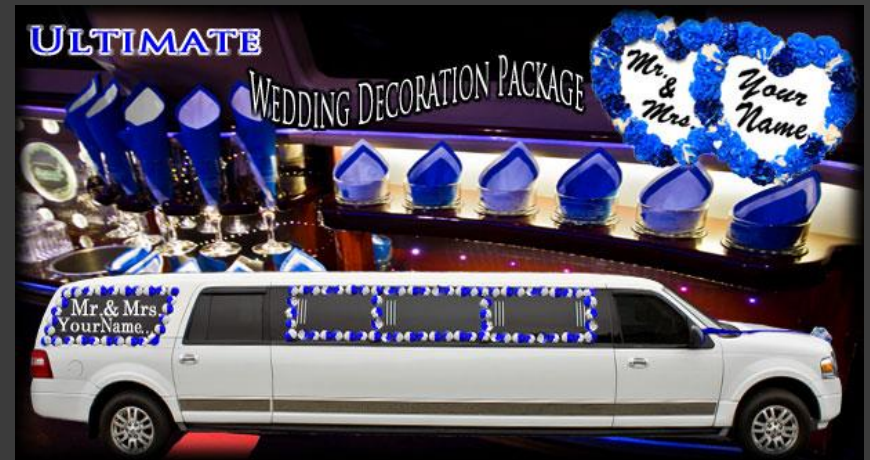
Name your event