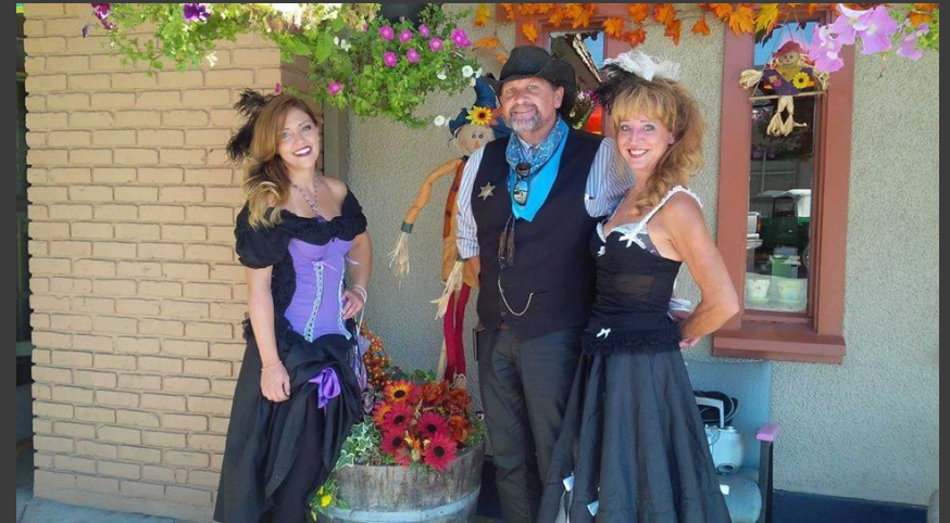
Enjoying the past in the present