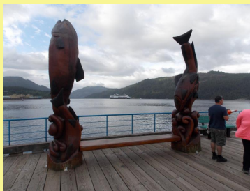
One of Port Alberni's most beautiful photo ops. This time with the MV Maasdam in the background. #ExplorePortAlberni