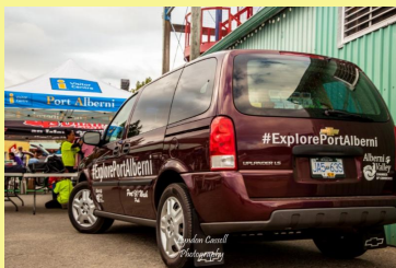
Our new Mobile Visitor Centre. Sponsored by Alberni District Co- op (fuel), Port Posh Wash (seeing it clean). #ExplorePortAlberni