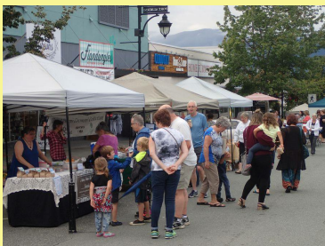
Arrowsmith View Market - Every Wednesday Evening Late June through August